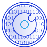
Intrusion Prevention System