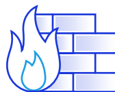
Fully Managed Firewall