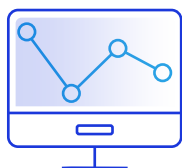
File Integrity Monitoring