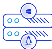
Linux & Windows Servers