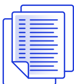
Log Management System