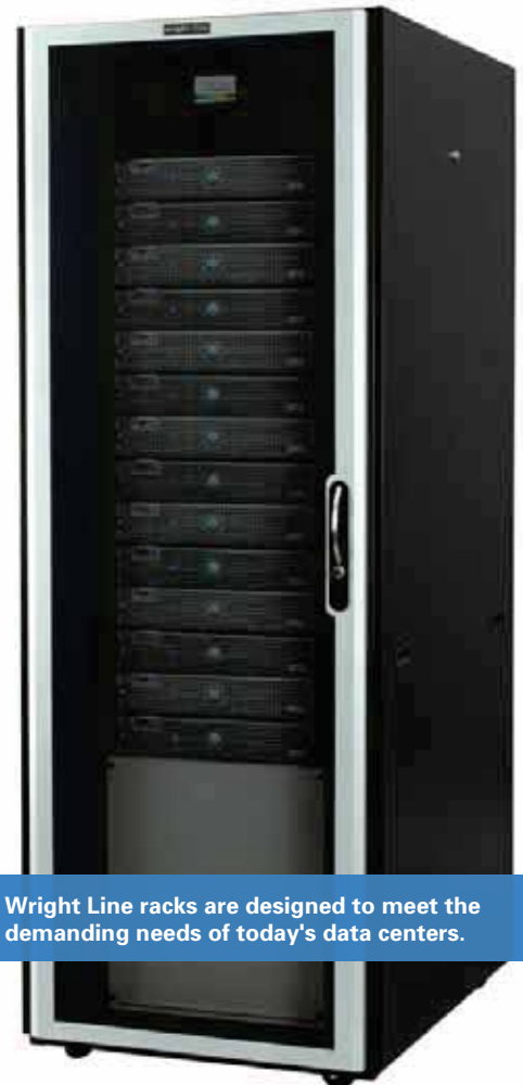
Wright Line racks are designed to meet the demanding needs of today's data centers.